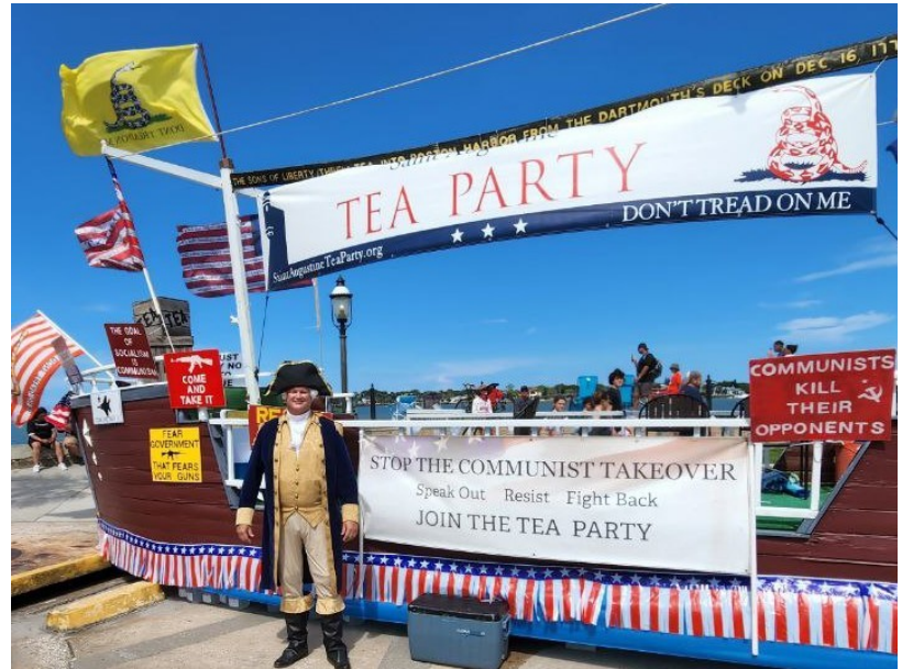
TCCR Staff Photos