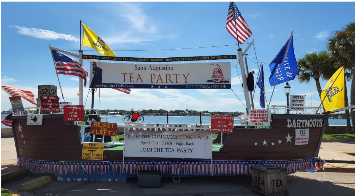
TCCR Staff Photo

the Dartmouth is located today. It was the Tea Party's refusal to recognize the free speech zone which created the media attention that opened up the Park and made the Park a free speech friendly place which has caused a peaceful situation since.