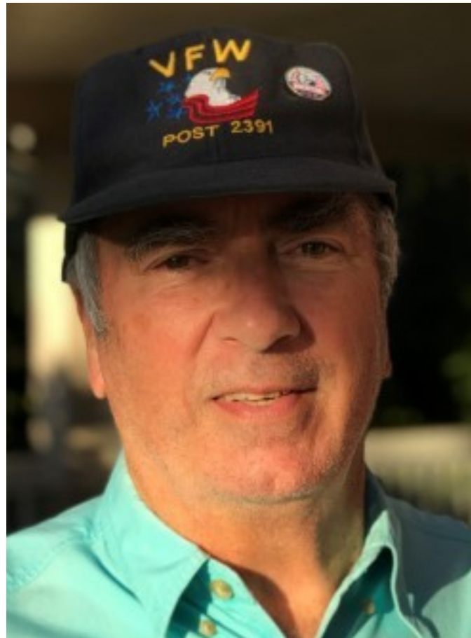
TCCR Staff Photo

Like our Facebook Page https://www.facebook.com/towncrier2010/