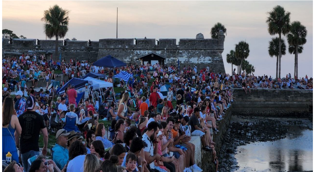
TCCR Staff Photo 7-4-22